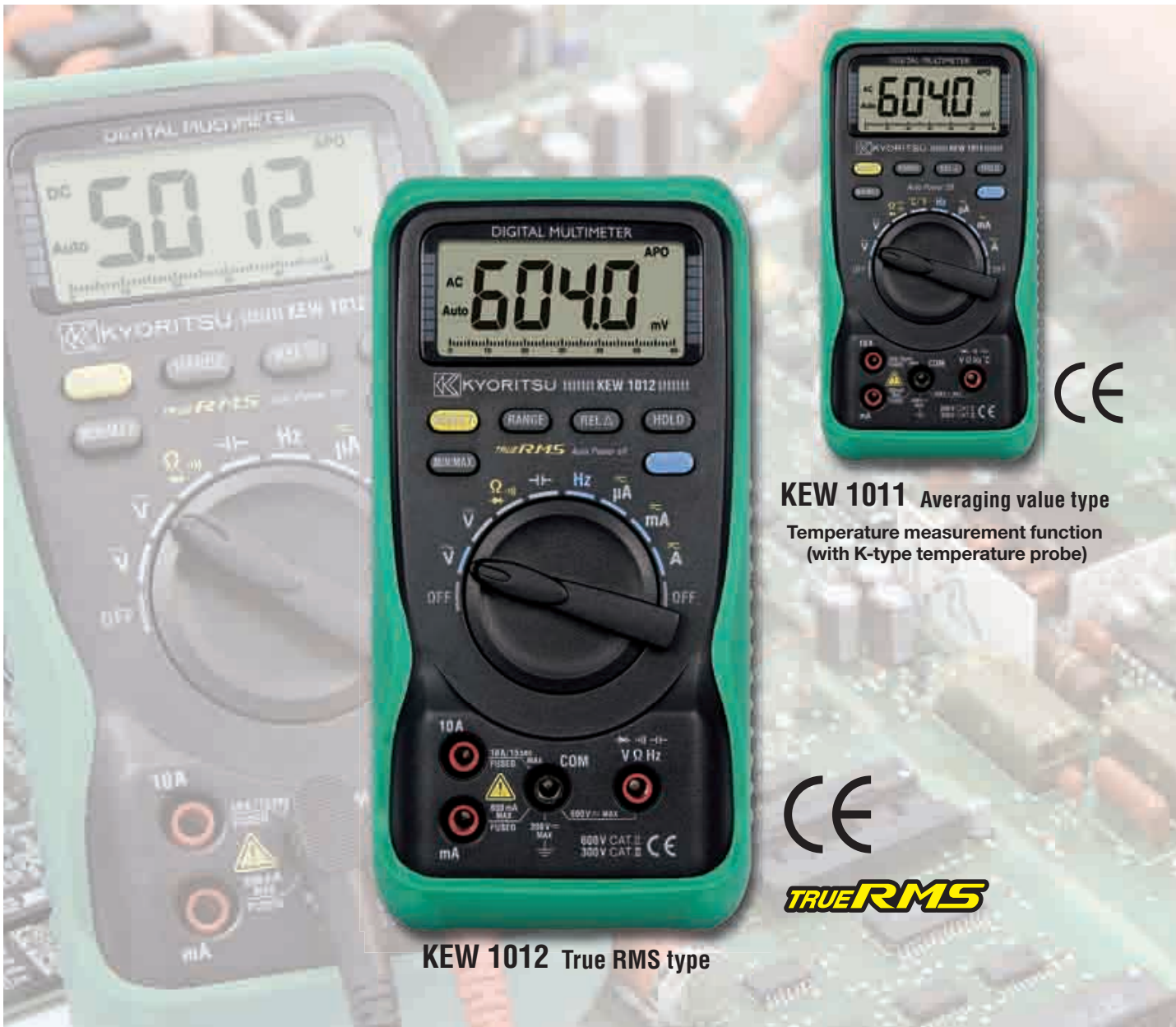
KEW 1012 True RMS type

DIGITAL MULTI METER SERIES KEW 1011 / 1012